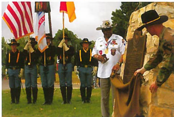
U.S. Army Unit Memorial, "Cavalry Formations" plaque dedication, June 17 th, 2006