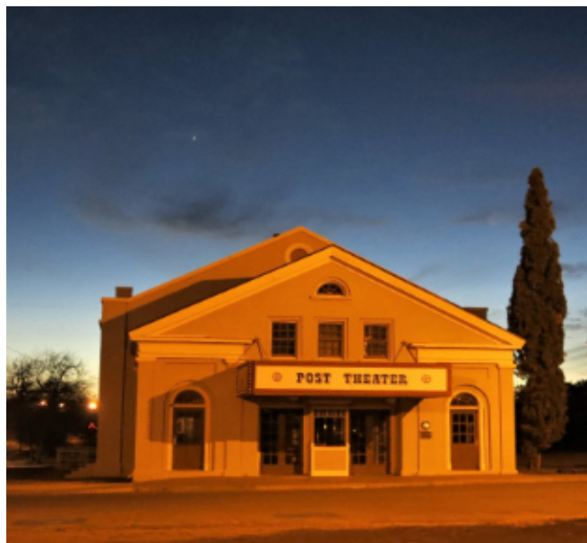
Christmas Star alignment, December 20, 2020

Oct 29: best view of Venus as the evening star, in the west just after sunset.