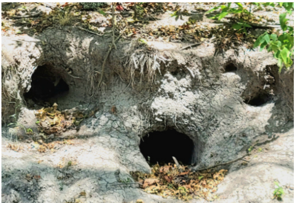
Did ET really phone home?

Editor's Note: Are you interested in meeting up with fellow space watchers? Would you like to participate in Stargazing night events here on Fort Clark Springs? If so please drop a line to recreation@fortclark.com and let us know. If enough people show an interest maybe we can do just that. Get together and enjoy the wonder of the night sky.